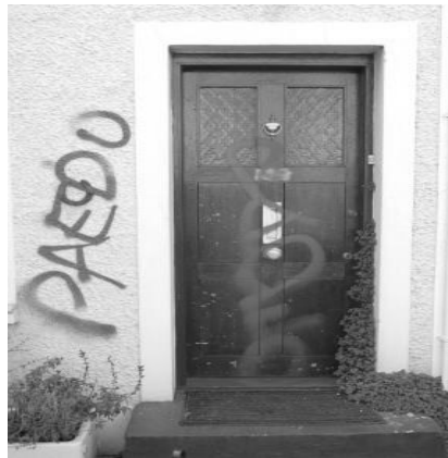
One example of the graffiti covering church buildings in Glasgow

Since that fateful night, details have been gradually leaked to the press, which has been poorly received by the Glasgow community. Up in arms about the accusations, the city has been split by those who blame