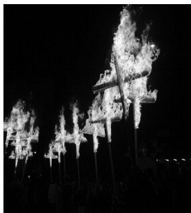
A fire has been lit

Unit's recent difficulties, there may be no-one left with the talent to get to the truth.