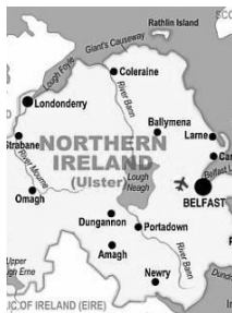
The Domain of Ulster

This month saw Pippa Beckett, the new Baron of Belfast, take the reins in earnest. She began the process of installing Anarchs in the relevant positions, which were largely drawn from her own supporters in the city. Some of those who supported Peter Fraser did find places under Beckett too though; some believe as a mere sop to keep them in line, others that it represents a real engagement with the whole Anarch city.