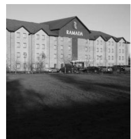
Ramada Jarvis Hotel, Paisley

"IT WAS ONLY THE INTERVENTION OF ROSINA'S GUARDS THAT STOPPED THE ATTACK"