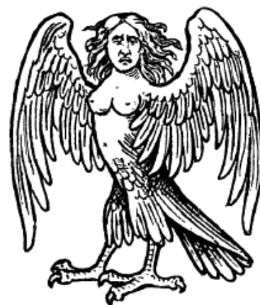
A Harpy, wings disclosed.