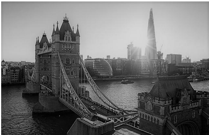
Tales from a Traveler

Please present yourself to a court official if you wish to see the Prince. If you have not yet been introduced at court, then failure to present yourself to the Prince will be considered a breach of hospitality.